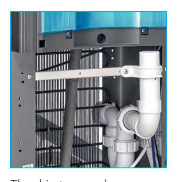
The drip tray can be connected to mains drainage. This can include a pump to pump the waste up to 150m and 3m high (factory installed).