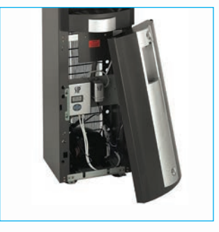
SIP Automatic 24/7 ozone sanitising with sleep mode. Reduces sanitising callouts by 50% and energy consumption by 40% – factory installed.