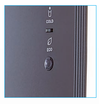
ECO sensor turns the boiler off when the office lights are switched off. Saves up to 25% in electricity!