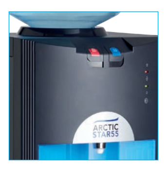
Modern, reliable, manual push down taps. Tamper and break resistant. Hot tap with safety lock.