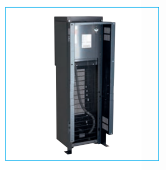
Cowling to fix the cooler securely to the wall – supplied separately. Also fits AA3300, AA4400 and ArcticChill88.