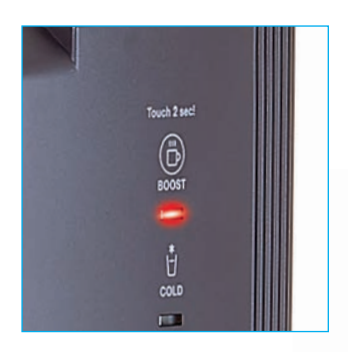
Hot water booster button to raise the temperature from 92°C to 95/96°C. Good for tea!