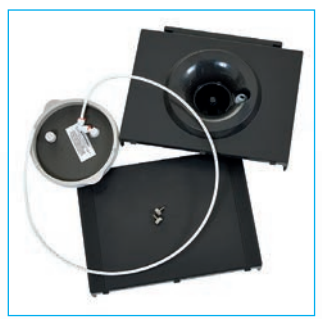
Easily convertible from bottled to POU. The bottle top includes Spil Guard leak protection.